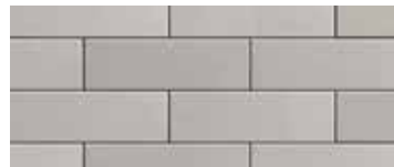
OPAL SPECIAL ORDER