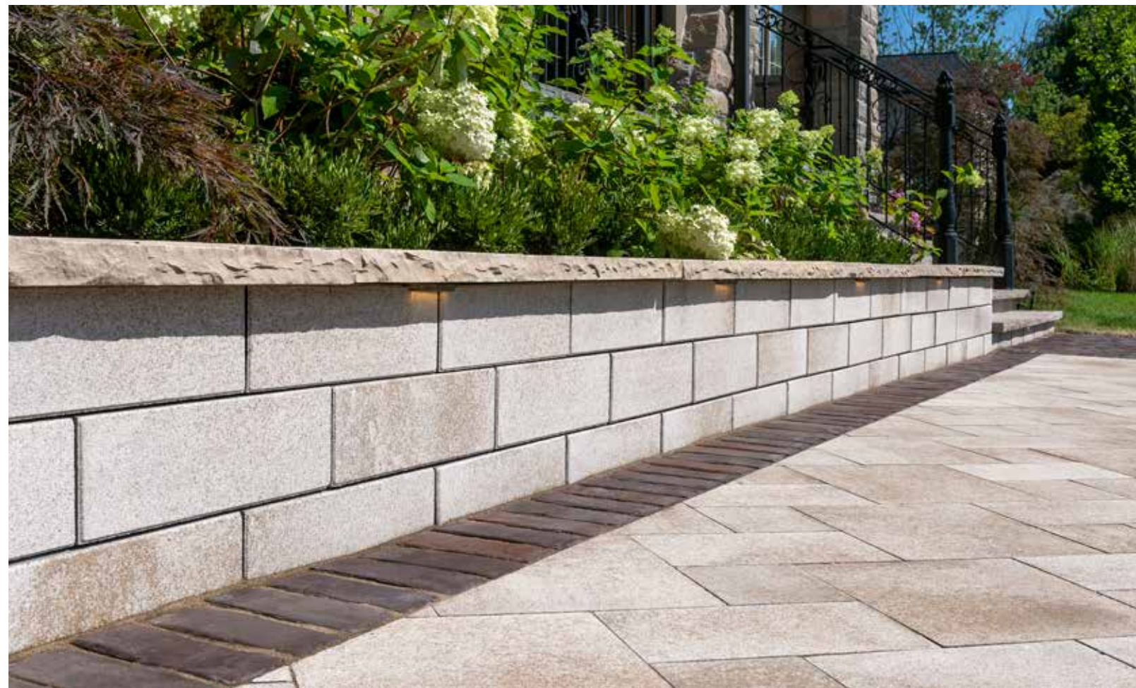
BOTTOM U-Cara (Summer Wheat Umbriano Finish) with Natural Stone (Golden Sand) coping Pavers: Umbriano (Summer Wheat) with Town Hall® (3 Color Blend)