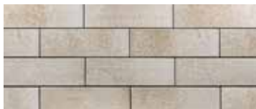
SUMMER WHEAT SPECIAL ORDER