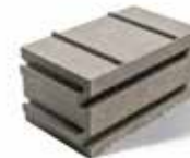
SURETRACK CORNER/PILLAR BACKER 6 x 7 x 12" 150 x 175 x 300mm