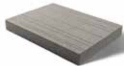
UNIVERSAL BASE UNIT 14 x 19 x 2" 355 x 482 x 55mm