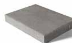
UNIVERSAL COPING 14 x 19 x 2¾" 355 x 482 x 70mm