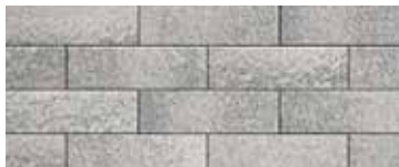
WINTER MARVEL SPECIAL ORDER