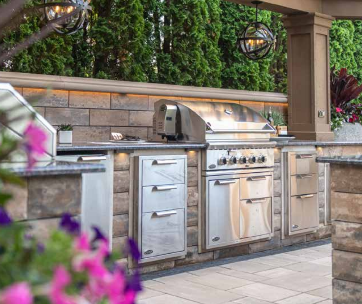
LEFT U-Cara (Fossil Pitched) with U-Cara (Fossil Smooth) backsplash Pavers: Beacon Hill™ Flagstone (Almond Grove) with Copthorne® (Basalt) accent