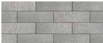
FRENCH GREY SPECIAL ORDER