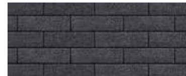
ONYX BLACK 3" PANEL ONLY

Steel Mountain with Universal coping (Light Grey)