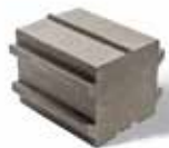
SURETRACK STANDARD BACKER 6 x 8 x 6" 150 x 200 x 150mm