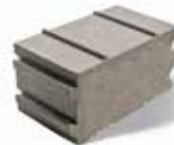
SURETRACK LARGE BACKER 6 x 7½ x 12" 150 x 190 x 300mm